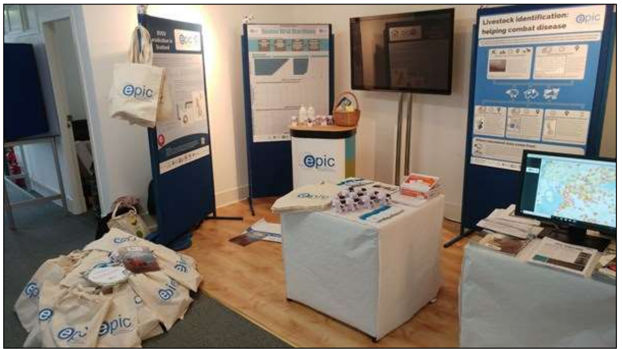
EPIC Stand in the SAOS building at RHS

In addition, EPIC hosted a panel discussion at the Royal Highland Pavilion in partnership with ScotEID, SG and the National Farmers Union Scotland (NFUS). The focus was again on BVDv control, with a message which emphasised the research work on this topic funded by RESAS, and the way in which this is being harnessed in partnership with industry and policy to progress disease control.